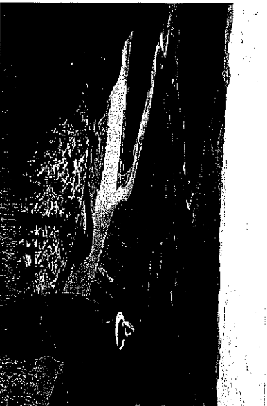
View from "The Dome" Dawson City, Yukon